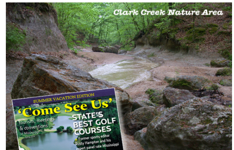
STILL PLANNING THAT SUMMER VACATION?

Our annual "Come See Us" magazine offers ideas for spots in Mississippi ranging from golf to culture to history to food. Click the photo for ideas, stories and access to the digital edition of this year's magazine.