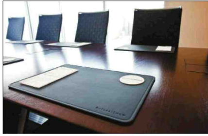
The Nashville Room is filled with natural light.