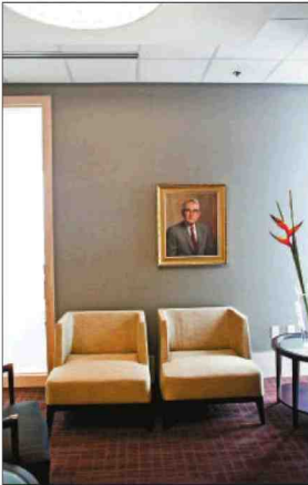
A client meeting space is located outside the Nashville Room.