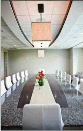
The Volunteer Room features white leather chairs.