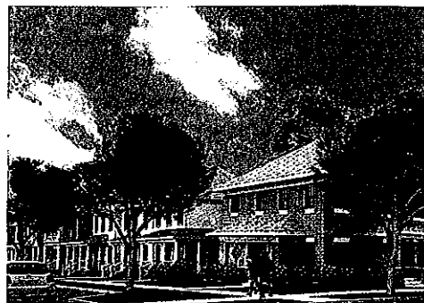
Gleaborn Pointe at Heritage Landing

Shareholder, Littler Mendelson, PC. B.A., Business, Rhodes College; J.D., Vanderbilt University School of Law. Vice Chair, Labor & Employment Section, Memphis Bar Association. Selected as 2011 Mid-South Super Lawyer. Martindale-Hubbell AV rating. Awards from Memphis Area Legal Services, Inc. for pro bono work. Vice Chancellor, Episcopal Diocese of West Tennessee. Trustee, Pink Palace Family of Museums. Founder and mentor, Helping Hands mentoring program, Church of the Holy Apostles.