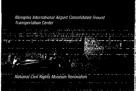
National Civil Rights Museum Renovation